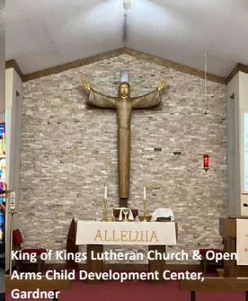
King of Kings Lutheran Church & Open Arms Child Development Center, Gardner