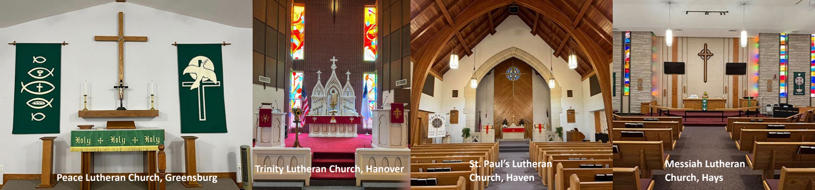
Peace Lutheran Church, Greensburg