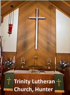
Trinity Lutheran Church, Hunter