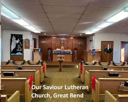
Our Saviour Lutheran Church, Great Bend