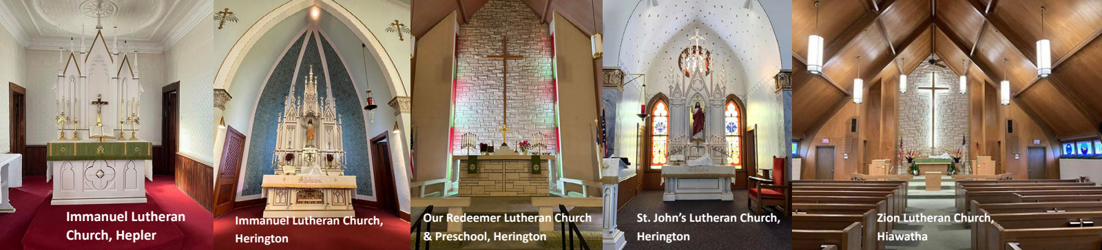
Immanuel Lutheran Church, Hepler