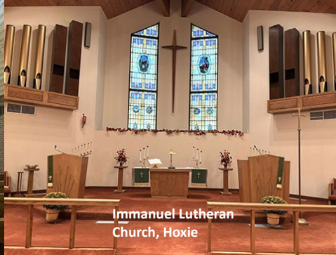
Immanuel Lutheran Church, Hoxie