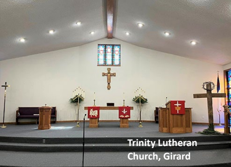
Trinity Lutheran Church, Girard