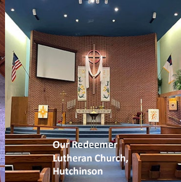
Our Redeemer Lutheran Church, Hutchinson