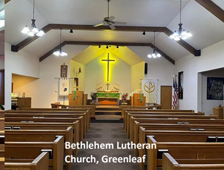
Bethlehem Lutheran Church, Greenleaf