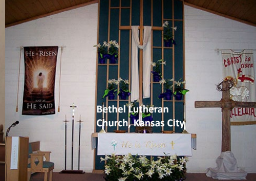
Bethel Lutheran Church, Kansas City