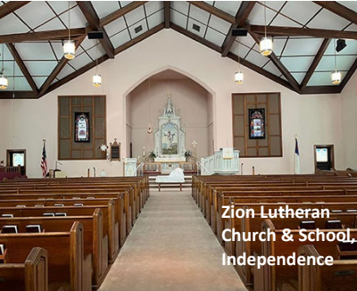
Zion Lutheran Church & School, Independence