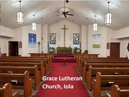
Grace Lutheran Church, Iola