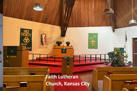
Faith Lutheran Church, Kansas City