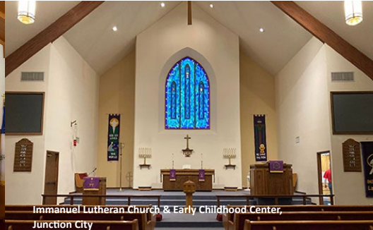
Immanuel Lutheran Church & Early Childhood Center, Junction City