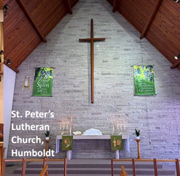
St. Peter's Lutheran Church, Humboldt