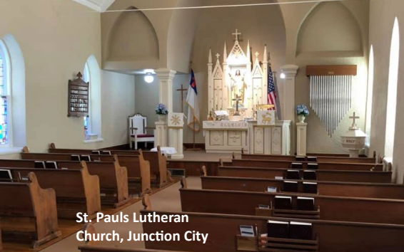
St. Paul's Lutheran Church, Junction City