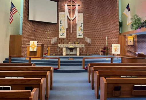
The sanctuary is prepared for Easter at Faith, Abilene, in April 2024