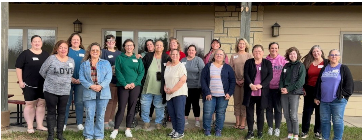
The Early Childhood Directors held a retreat November 15-16, at the Kansas District Retreat Center in Herington.