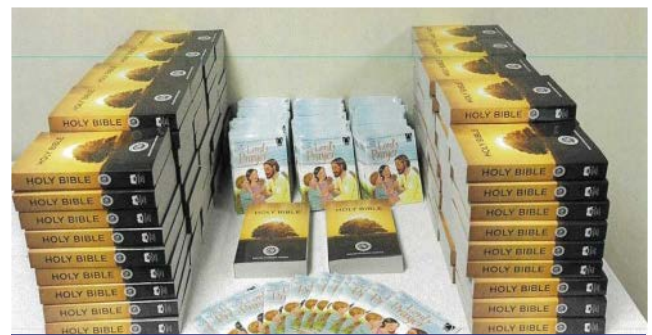
Christ Lutheran Church, Topeka received a mission grant to order 100 ESV Outreach Bibles and 100 Mini Arch Books from CPH, to give away at community outreach events.

The deadline to submit applications is Friday, Sept. 20.