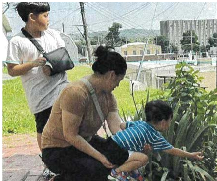
ICOA, Kansas City hosts Bebes Felices (Happy Babies), a weekly gathering that supports mothers and their children.

The Kansas District is committed to helping congregations and organizations pursue mission projects in Kansas. The District sets aside 10 percent of its congregational receipts each year and makes these funds available in the form of mission grants.