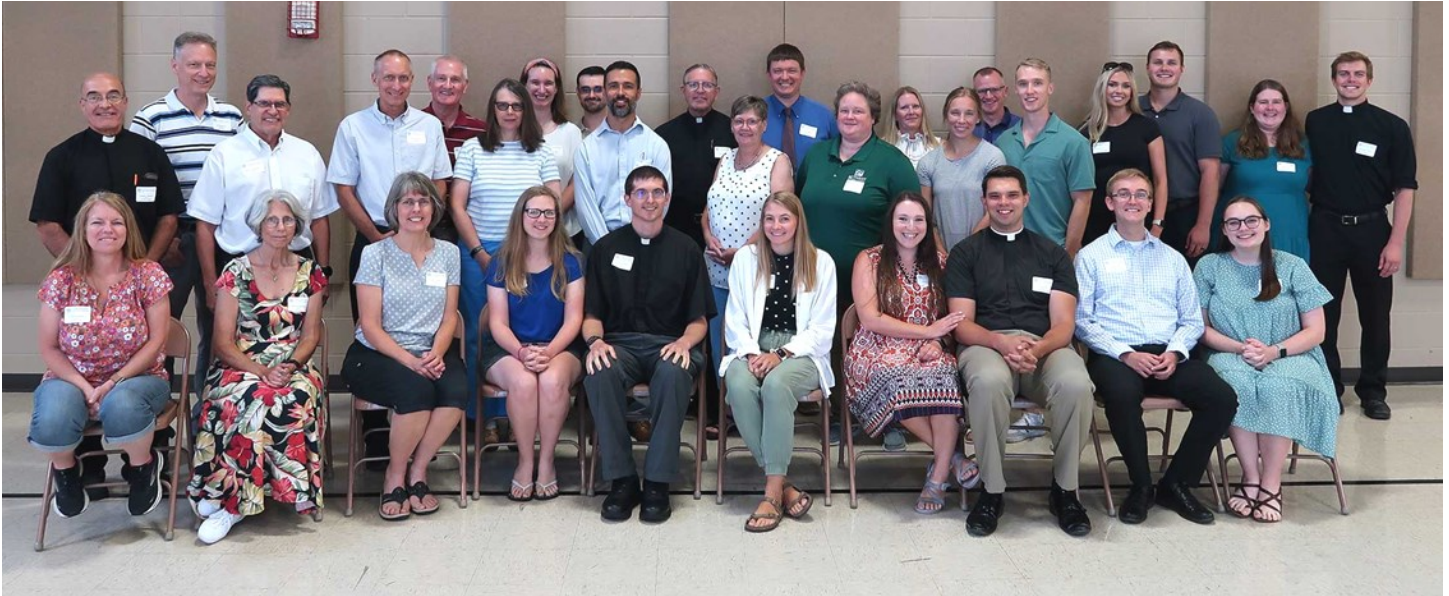
The Kansas District New Worker Orientation was held at St. John's Ev. Lutheran Church in Topeka on July 31, 2024. Welcome all new church workers to the Kansas District!