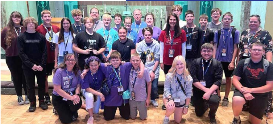
Above: Kansas youth and adults attend the June 25-28 Higher Things conference in Mequon, Wis. Below: Kansas youth and adults attend the July 16-19 Higher Things conference in Clarksville, Ariz.

Our mission is to support and encourage the members of the District in carrying out the mission Christ has given His Church.