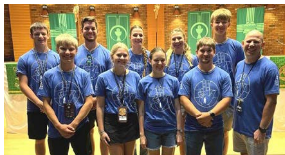
Kansas youth and adults attend the July 23-26 Higher Things conference in Portland, Ore.

Join the Kansas District Youth Ministry Facebook page!