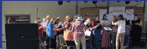
The choirs from Our Redeemer, Hutchinson, and Trinity, Salina, sang at the Sunday worship service.