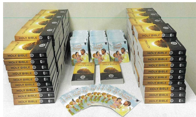
Christ Lutheran Church, Topeka received a mission grant to order 100 ESV Outreach Bibles and 100 Mini Arch Books from CPH, to give away at community outreach events.

The deadline to submit applications is Friday, Sept. 20.