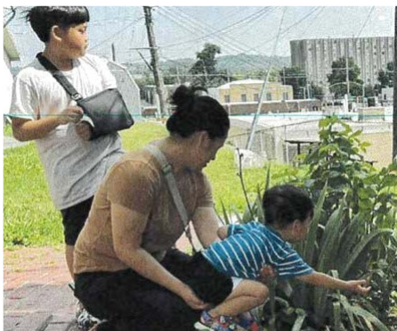
ICOA, Kansas City hosts Bebes Felices (Happy Babies), a weekly gathering that supports mothers and their children.

The Kansas District is committed to helping congregations and organizations pursue mission projects in Kansas. The District sets aside 10 percent of its congregational receipts each year and makes these funds available in the form of mission grants.