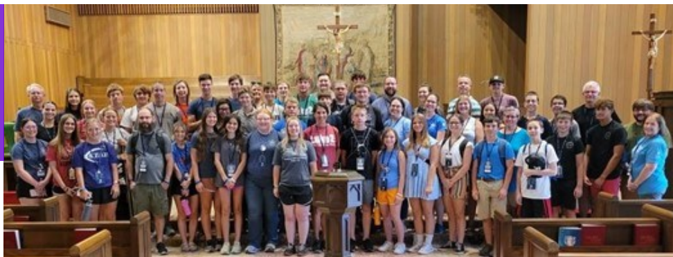
Kansas District youth at the Higher Things Conference in San Antonio, Texas, July 2023.

Greetings! Two of the three Higher Things Conferences (Mequon, WI and Clarksville, AR) for this summer are full. Any further registrations will be placed on the waitlist. If you have not yet registered for a Higher Things Conference, be sure to get a spot on the waitlist! If another group cancels, you might still be able to go.