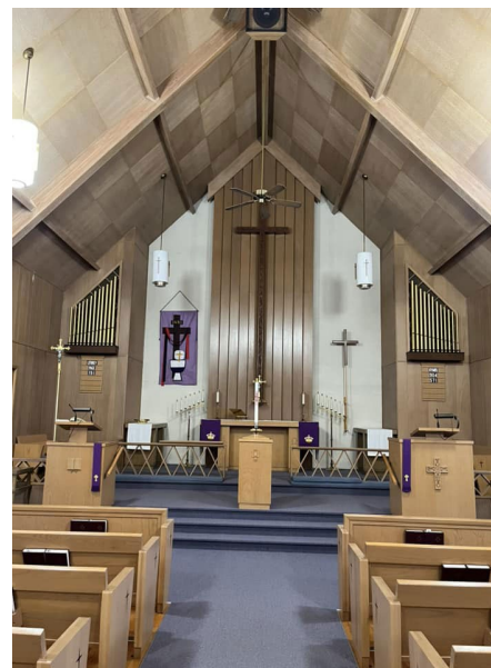
The sanctuary is prepared for Lent at Grace, McPherson, in March 2023.