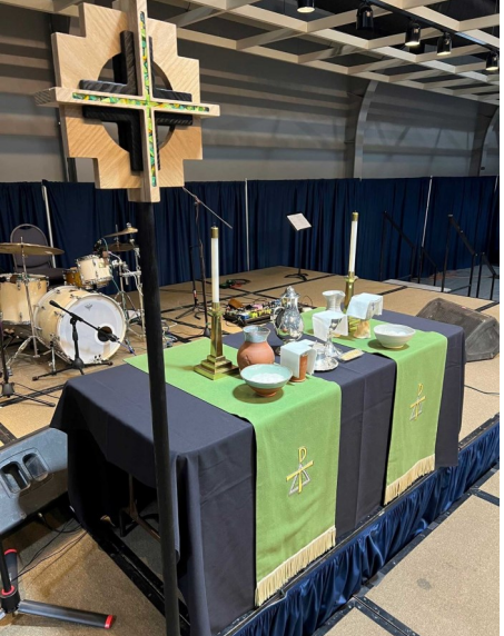
A Sunday morning Divine Service was held at the KDYG.