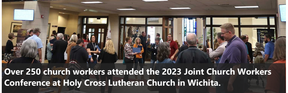
Over 250 church workers attended the 2023 Joint Church Workers Conference at Holy Cross Lutheran Church in Wichita.