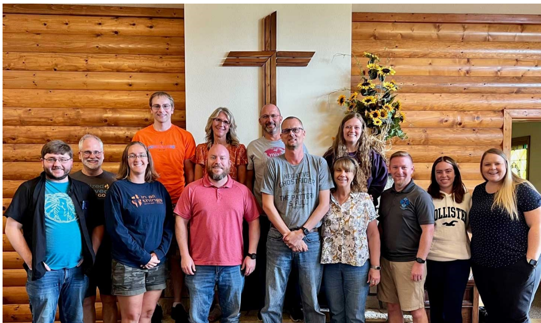
The Kansas District Youth Ministry Committee gathered at the Retreat Center in Herington on September 9, 2023, for their semi-annual planning meeting. Representatives include pastors, youth workers and adult & youth lay leaders from across the Kansas District.