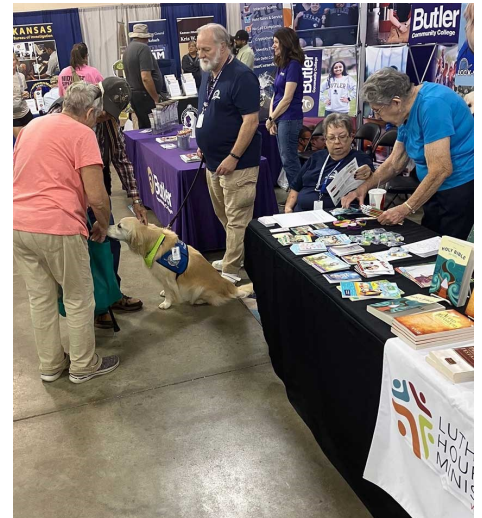
Volunteers from Immanuel, Ellsworth, help out at the LLL/LHM booth.