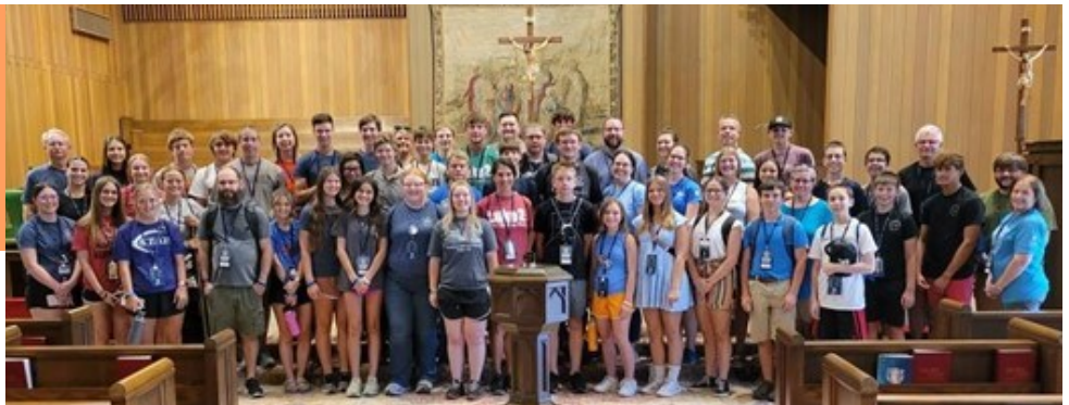
Kansas District youth at the Higher Things Conference in San Antonio, Texas, July 2023.

Imagine walking into a chapel with 700+ youth, and there being silence. Reverent silence, waiting with those who believe in the same Lord, who will commune together in the Divine Service. Then the organ starts, and it is silent no more. Together your voices are raised, praising the God who died for you. You sing the liturgy and hymns of our church confessing the one faith in your Lord Jesus. In those young voices, you can hear the echoes of heavenly worship that last unto eternity.