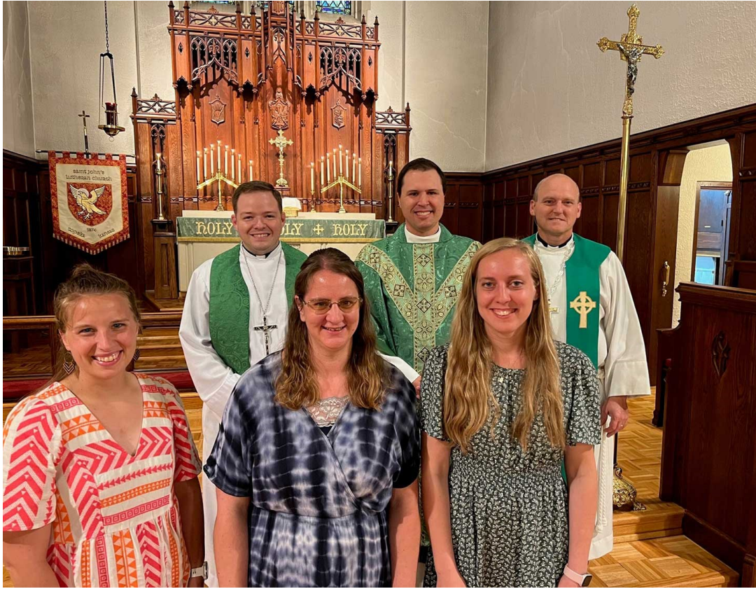
The opening Divine Service and teacher installations to begin the school year at St. John's Classical Lutheran School, in Topeka.