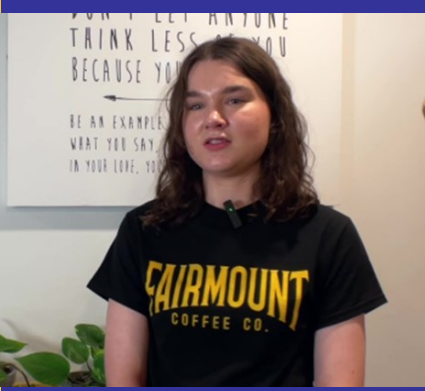
Table Talk is a free meal! Table Talk is on Sundays at noon, held on the 1 st Sunday of the month at Christ Lutheran Church (4592 Green Valley Road, Manhattan, KS 66502) and the 2 nd through 5 th Sundays of the month at St. Luke's (4801 Anderson Avenue, Manhattan, KS 66503). The first Table Talk of this school year will be Sunday, August 27, at noon at St. Luke's. (Please note that there will be no Table Talk Sunday, September 3, Labor Day Weekend). More information can be found at St. Luke's Campus Ministry website page or LCMS U K-State website page.

The Lutheran campus ministries at Kansas colleges and universities provide a "church home away from home" for students. Visit the Campus Ministry page on the Kansas District website to find Campus Ministry locations and contact information.