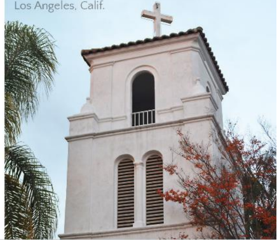
St. Paul Evangelical Lutheran Church Los Angeles, Calif.

DISCOVER OUR RANGE OF MINISTRY AND PERSONAL LOANS. VISIT LCEF.ORG/LOAN-RATES TODAY!