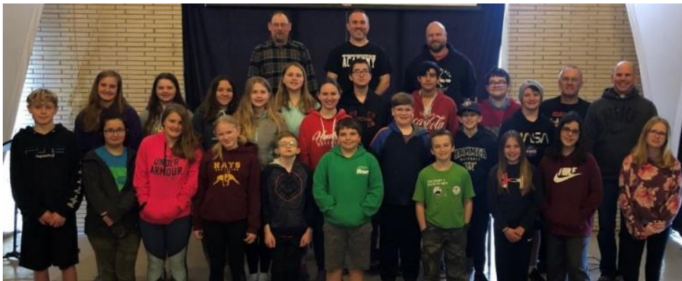
On March 19-20, 22 youth and nine adults from several congregations gathered for the Western Kansas Confirmation Retreat, hosted at Lakeview Christian Camp in Stockton, Kansas. Participating congregations included Messiah, Hays; Redeemer, Atwood; Trinity, Colby; Trinity, Garden City; First, Plainville; and Immanuel, Oakley/Hoxie.

After exploring numerous possibilities, the KDYMC is excited to announce that we are adding new middle school youth offerings. The KDYMC is forming a middle school confirmation retreat committee which will begin by connecting congregations that are interested in having a confirmation retreat with congregations willing to invite other congregations to join their own confirmation retreats. The committee intends to expand confirmation retreat offerings in the future.