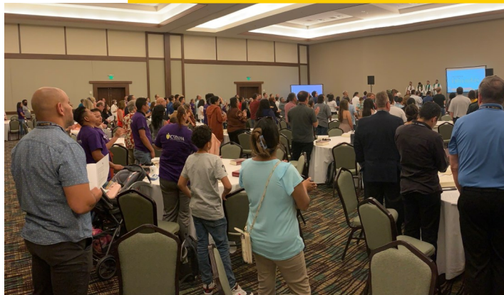
Convention participants at the Hispanic Ministry worship service.