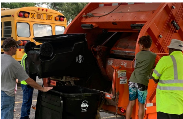
Volunteers empty bins into the garbage truck with workers from Shawnee County Solid Waste.