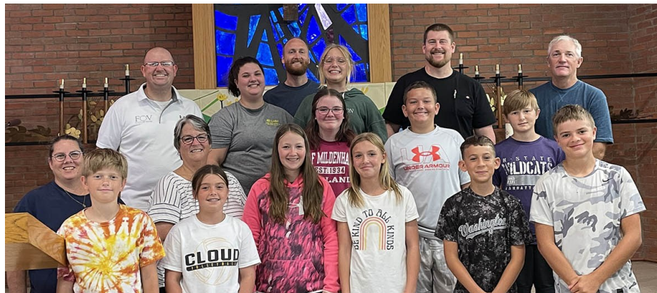
Participants from St. Paul, Clay Center, Bethlehem, Greenleaf, and Zion, Linn, gathered for a Jesus Door-2-Door event on Sept. 17.