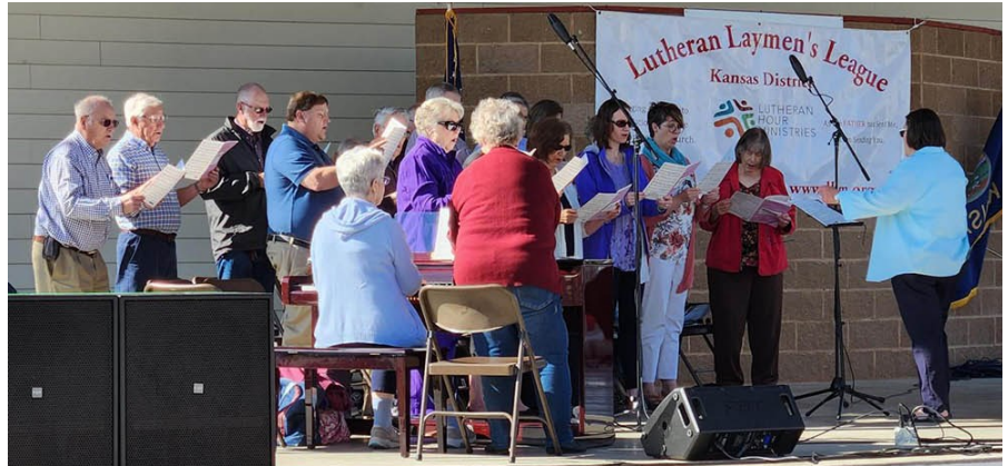
The choir from Trinity, Salina, performs at the worship service.

Our mission is to support and encourage the members of the District in carrying out the mission Christ has given His Church.