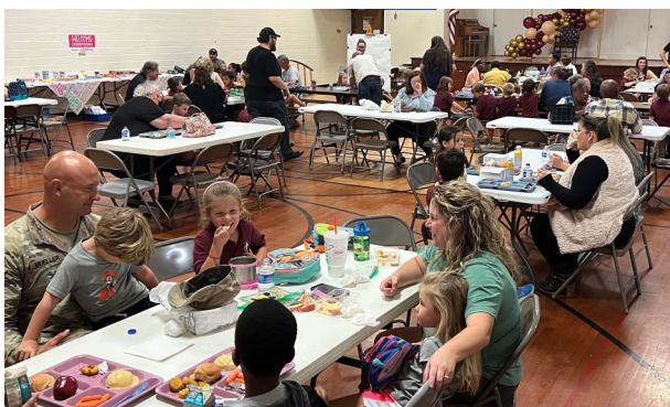
St. Paul Lutheran Church and School, Leavenworth, celebrated Grandparents and Special Persons Day on Sept. 9.