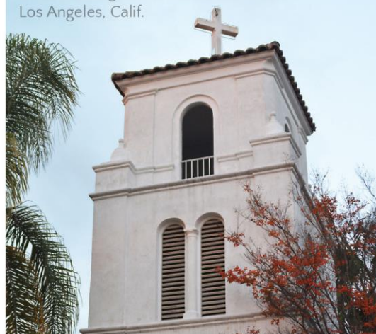
St. Paul Evangelical Lutheran Church Los Angeles, Calif.

DISCOVER OUR RANGE OF MINISTRY AND PERSONAL LOANS. VISIT LCEF.ORG/LOAN-RATES TODAY!