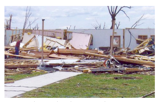
Peace Lutheran Church in Greensburg after the May 7, 2007 tornado.

remaining, a tent was leased, which was short-lived due to daily winds. Orphan Grain Train (OGT) representative John White called to tell of a drinking water transport enroute from Norfolk, Neb. I was to arrange for (drinking) water to fill the 5,000-gallon tanker for public use by Greensburg.