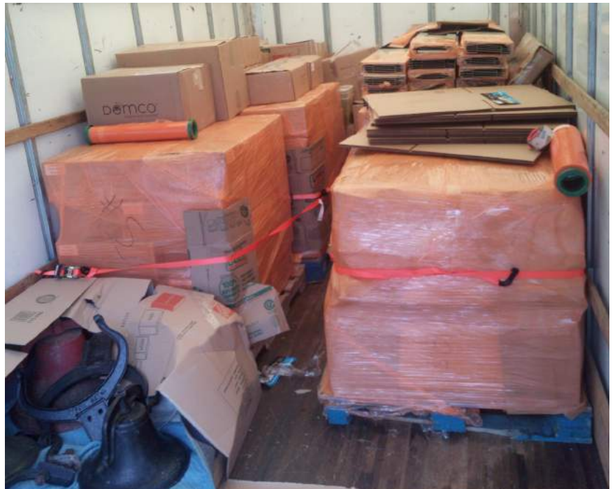
Donated bells, shelving, and books from the Ft. Wayne Seminary library Chemnitz Library Initiative.