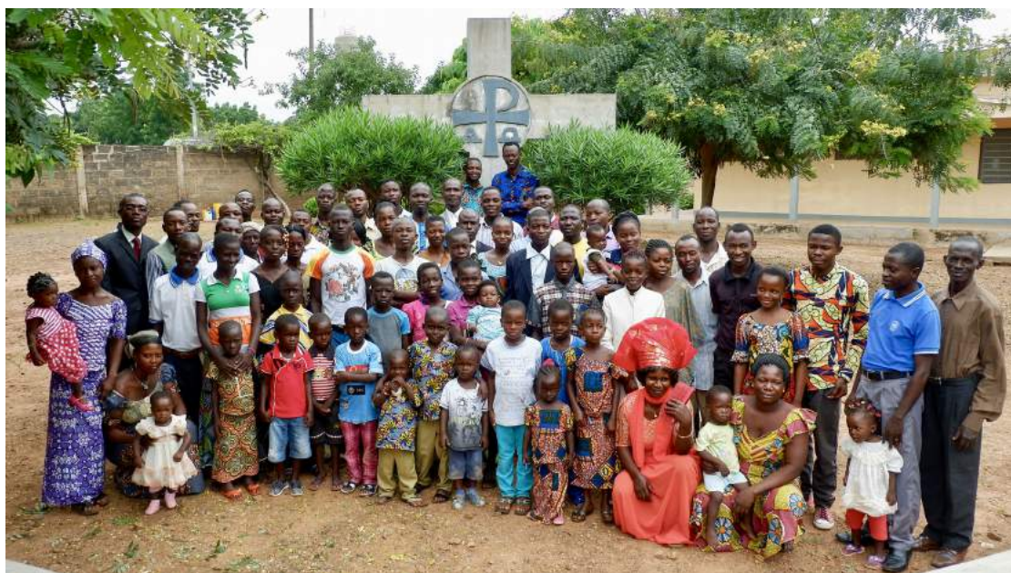
The current CLET students and their families after opening service on August 26 th 2017.

This year the CLET community was blessed to have 6 of the students' wives who have arrived with or gained an adequate command of French to pursue a level of theological education while their husbands are studying in the pastoral program. It is hoped that this could develop into a more formal deaconess program. I will be sure to update you on the progress of these women in their studies.