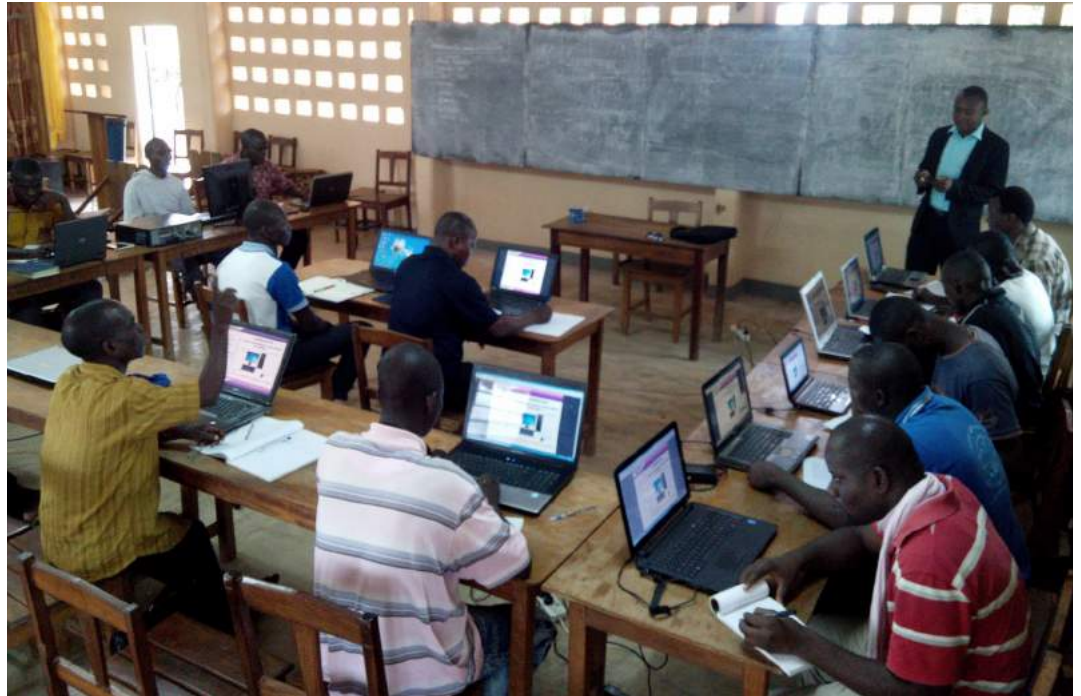
The Pastoral 1 students (second year) participate in a computer class over the summer.

For the Lord gives wisdom; from his mouth come knowledge and understanding; he stores up sound wisdom for the upright; he is a shield to those who walk in integrity, guarding the paths of justice and watching over the way of his saints.