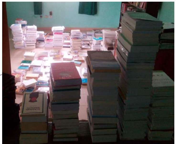
Hundreds of theological books in French at my home in Dapaong. They are being stacked and organized according to their final destinations at the three theological libraries.