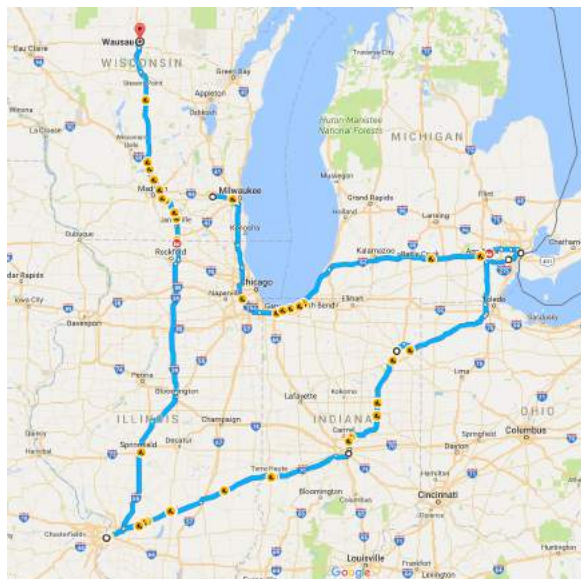
Route taken to pick up donations in August 2017.