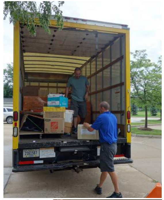
Above right: Loading up books at Lutheran Heritage Foundation offices in Macomb, MI.