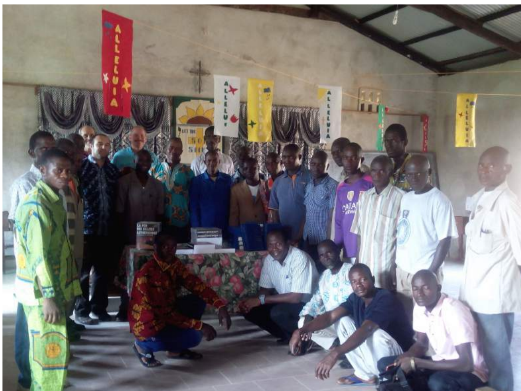
Participants in the theological seminar on Confession and Absolution in Gueckedou, Guinea pose with copies of the hymnal in French and copies of the Lutheran Confessions in French

and the leaders on single photocopied sheets. Thanks to a generous donor through Mission Central in Mapleton, Iowa, we have been able to print out laminated poster-size flip chart form. In this way, each evangelist, pastor, and congregation can have their own set that they can easily set up in the church building, or on a tree or post in a market area for instruction. These poster charts have just been printed in Wisconsin and will be sent to West Africa in the large shipping container that will depart in late 2017.