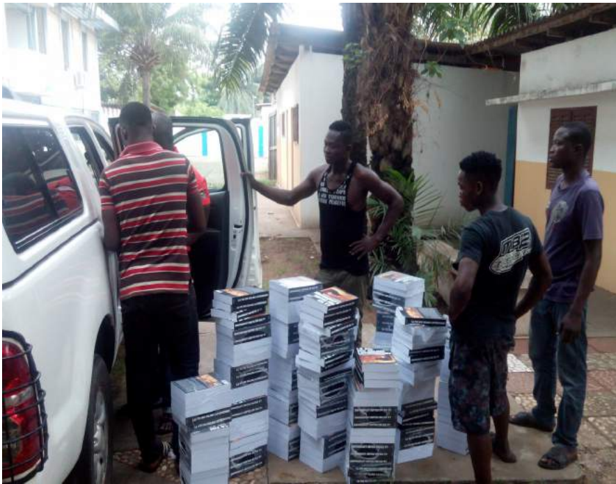
Loading up copies of the Lutheran Confessions in French into my truck to be taken up north to the CLET seminary for distribution.