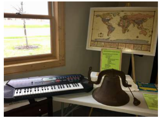
Right: The collection display of St. Mark Lutheran Church of Rhineland, WI.